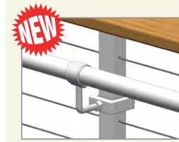
S0904-XX60* (clamp) & S0901-0401 (rail mid support)

Colors from left to right: Black, Metallic Silver, Pure White, Pebble Grey, Brown, Bright Red and Deep Red. *Uncoated option available upon request.