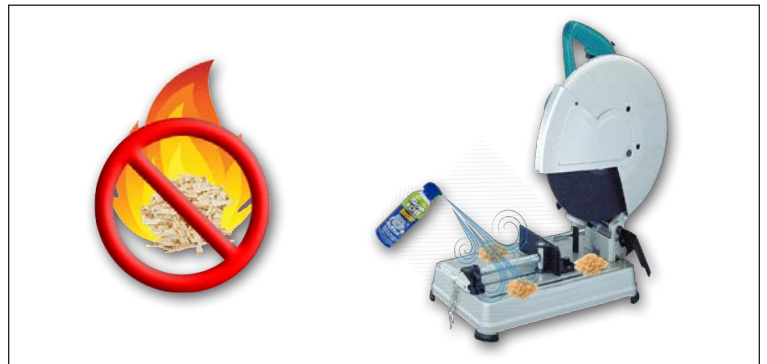
Figure E. Remove any and all saw dust from chop saw.

Be sure the saw has been thoroughly cleaned out of any sawdust, as the sparks could ignite the saw dust (See Figure E ). You can achieve this with a dust pan & brush, vacuum, can of air, etc. to remove the saw dust.