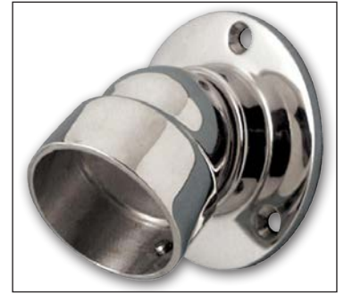
Figure E. (Left) RailEasy Straight Sidemount (C0975-0002).