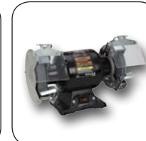
Grinder (Hand Grinder)