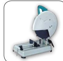
Chop Saw (Compound Miter Saw)