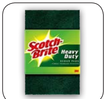
Scotch-Brite™ Pad (Polishing/Buffering Pad)