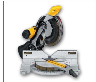
Figure A. (Left) Use a common Chop Saw.